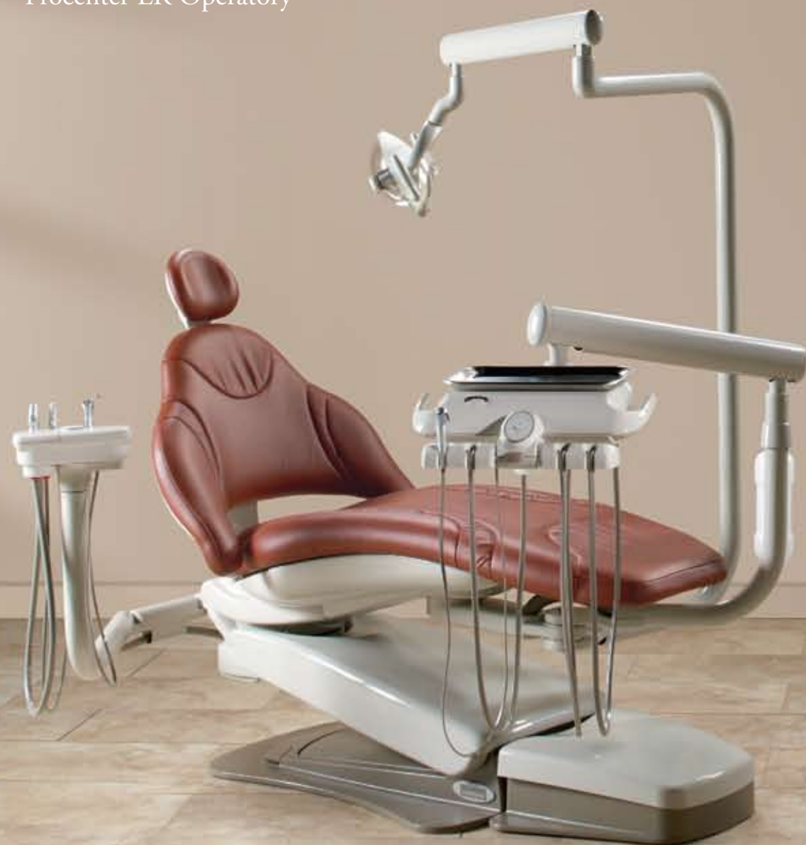
Elevance™ Procenter LR Operator